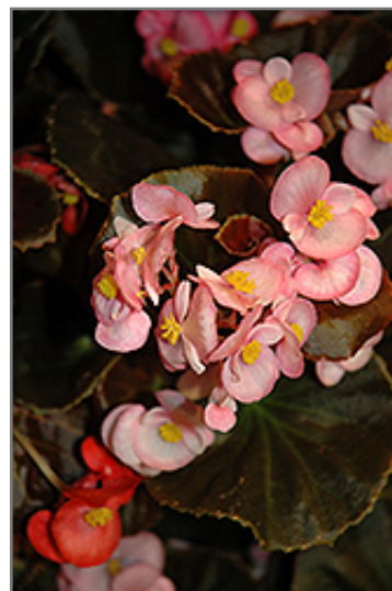
Nightife Pink Begonia flowers

This is a high maintenance plant that will require regular care and upkeep, and usually looks its best without pruning, although it will tolerate pruning. Deer don't particularly care for this plant and will usually leave it alone in favor of tastier treats. Gardeners should be aware of the following characteristic(s) that may warrant special consideration;