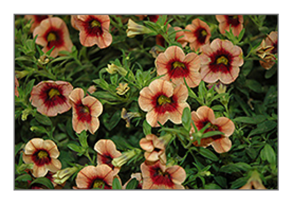
WonderCali Super Salmon Calibrachoa flowers