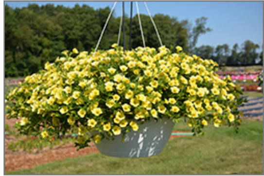
Million Bells Trailing Yellow Calibrachoa in bloom

Million Bells Trailing Yellow Calibrachoa is a fine choice for the garden, but it is also a good selection for planting in outdoor containers and hanging baskets. Because of its trailing habit of growth, it is ideally suited for use as a 'spiller' in the 'spiller-thriller-filler' container combination; plant it near the edges where it can spill gracefully over the pot. It is even sizeable enough that it can be grown alone in a suitable container. Note that when growing plants in outdoor containers and baskets, they may require more frequent waterings than they would in the yard or garden.