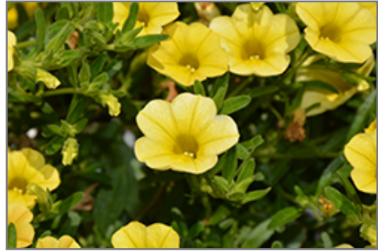
Million Bells Trailing Yellow Calibrachoa flowers

Million Bells Trailing Yellow Calibrachoa is a dense herbaceous annual with a trailing habit of growth, eventually spilling over the edges of hanging baskets and containers. Its medium texture blends into the garden, but can always be balanced by a couple of finer or coarser plants for an effective composition.