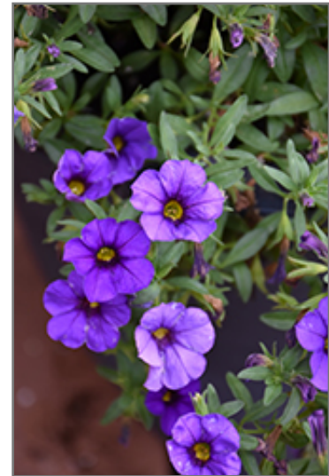
Aloha Kona Midnight Blue Calibrachoa flowers

Aloha Kona Midnight Blue Calibrachoa is recommended for the following landscape applications;