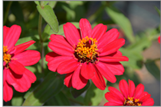
Profusion Double Hot Cherry Zinnia flowers