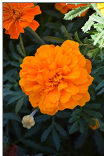
Safari Tangerine Marigold flowers