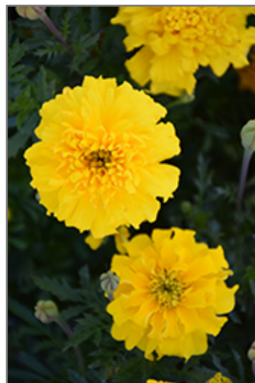
Cresta Yellow Marigold flowers