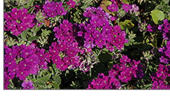
Lanai Blue Verbena flowers

A vigorous, versatile series with excellent powdery mildew resistance; its trailing habit is perfect for hanging baskets, mixed containers, or beds