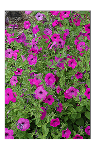
Laura Bush Petunia flowers

Laura Bush Petunia will grow to be about 18 inches tall at maturity, with a spread of 30 inches. When grown in masses or used as a bedding plant, individual plants should be spaced approximately 24 inches apart. Its foliage tends to remain dense right to the ground, not requiring facer plants in front. This fast-growing annual will normally live for one full growing season, needing replacement the following year.