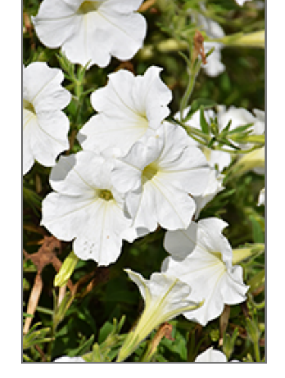
Sun Spun White Petunia flowers