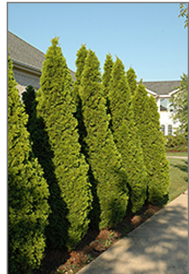
Emerald Green Arborvitae