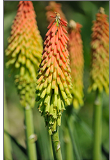
Fire Dance Torchlily flowers

Amazing red, orange, and bright yellow flower stalks rise from grassy, evergreen foliage in midsummer, creating a brilliant border or container planting; makes a great cutflower and attracts hummingbirds