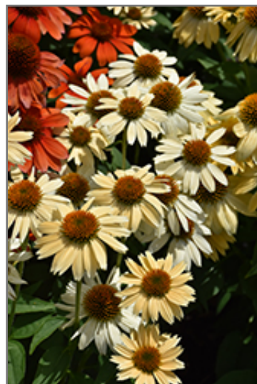
Sombrero Sandy Yellow Coneflower flowers

Sombrero Sandy Yellow Coneflower is recommended for the following landscape applications;