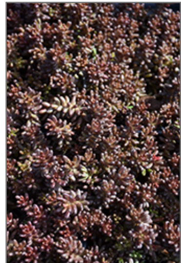
Murale Stonecrop foliage