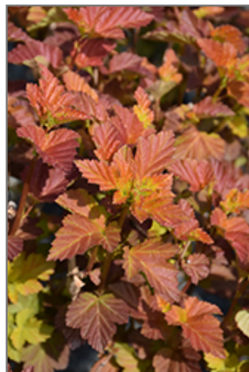
Amber Jubilee Ninebark foliage

This shrub will require occasional maintenance and upkeep, and can be pruned at anytime. It has no significant negative characteristics.