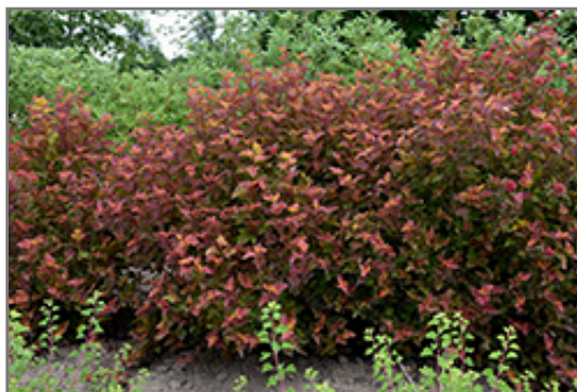
Amber Jubilee Ninebark

Amber Jubilee Ninebark will grow to be about 6 feet tall at maturity, with a spread of 4 feet. It has a low canopy, and is suitable for planting under power lines. It grows at a medium rate, and under ideal conditions can be expected to live for approximately 30 years.