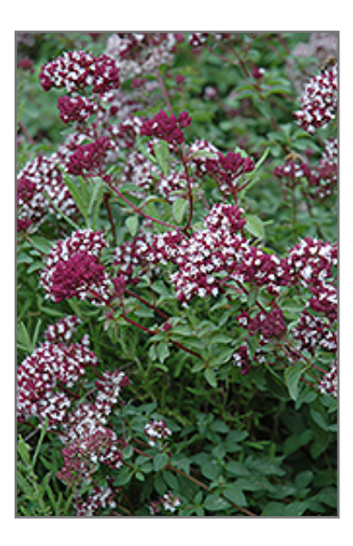
Zorba Red Oregano flowers

Aside from its primary use as an edible, Zorba Red Oregano is sutiable for the following landscape applications: