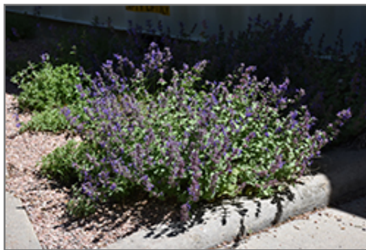
Little Trudy Catmint in bloom