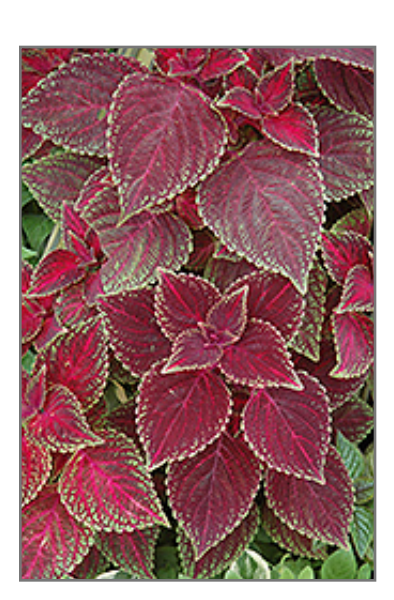
Volcano Coleus foliage

Volcano Coleus will grow to be about 20 inches tall at maturity, with a spread of 18 inches. When grown in masses or used as a bedding plant, individual plants should be spaced approximately 15 inches apart. Although it's not a true annual, this fast-growing plant can be expected to behave as an annual in our climate if left outdoors over the winter, usually needing replacement the following year. As such, gardeners should take into consideration that it will perform differently than it would in its native habitat.