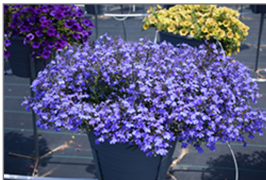
Techno Electric Blue Lobelia in bloom

Techno Electric Blue Lobelia will grow to be about 8 inches tall at maturity, with a spread of 12 inches. When grown in masses or used as a bedding plant, individual plants should be spaced approximately 10 inches apart. Its foliage tends to remain low and dense right to the ground. Although it's not a true annual, this fast-growing plant can be expected to behave as an annual in our climate if left outdoors over the winter, usually needing replacement the following year. As such, gardeners should take into consideration that it will perform differently than it would in its native habitat.