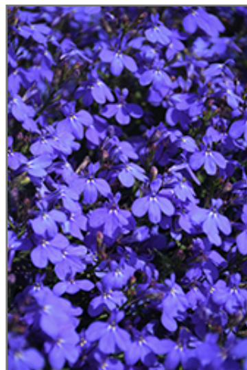
Techno Electric Blue Lobelia flowers

Techno Electric Blue Lobelia is recommended for the following landscape applications;