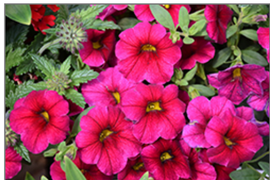
Superbells Cherry Red Calibrachoa flowers