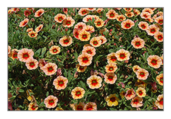
MiniFamous iGeneration Apricot Red Eve Calibrachoa flowers

MiniFamous iGeneration Apricot Red Eye Calibrachoa is recommended for the following landscape applications;