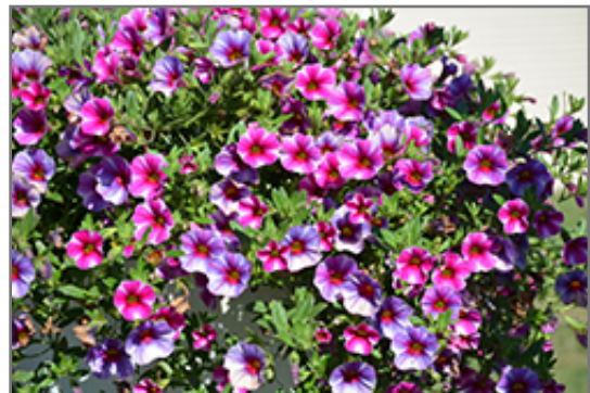
Can-Can Hot Pink Star Calibrachoa flowers