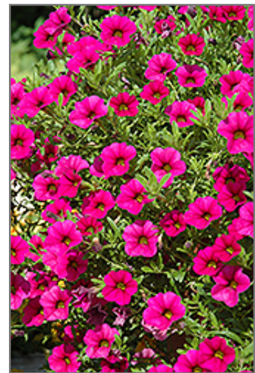
Cabaret Rose Calibrachoa flowers