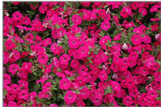
Tidal Wave Hot Pink Petunia in bloom

Moana Lane Garden Center & Corporate Office 1100 W. Moana Lane Reno, NV 89509 (775) 825-0600 (775) 825-0602 - Corporate Office