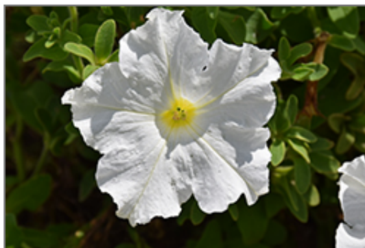
Pretty Flora White Petunia flowers