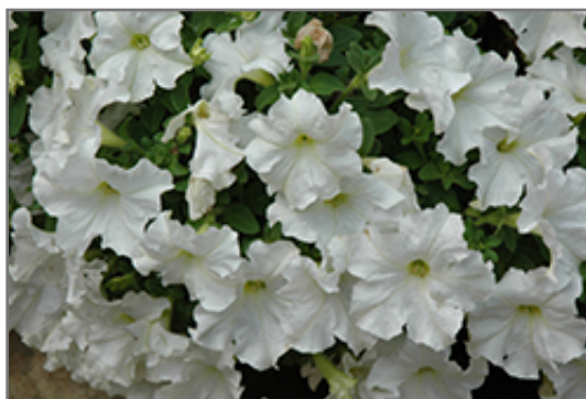
Pretty Flora White Petunia flowers