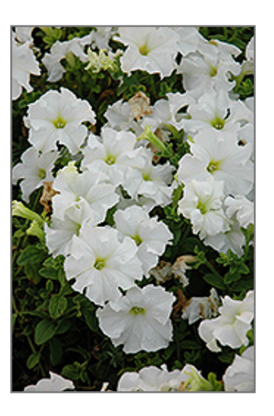
Paparazzi White Diamonds Petunia flowers