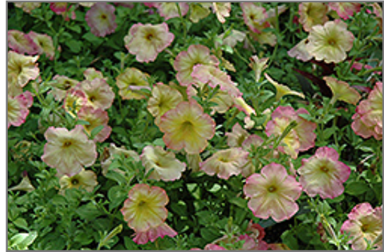
Debonair Dusty Rose Petunia flowers