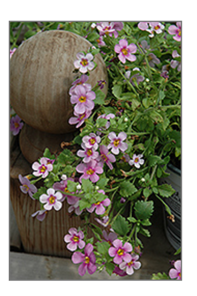
Savoir Faire Ballet Pink Bacopa flowers