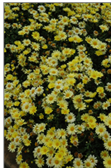
Butterfly Marguerite Daisy flowers