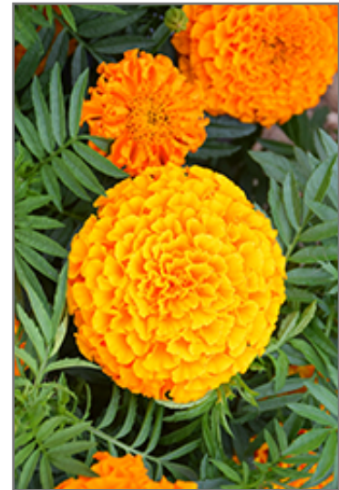
Taishan Orange Marigold flowers