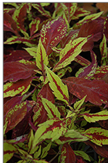
Pineapple Coleus foliage