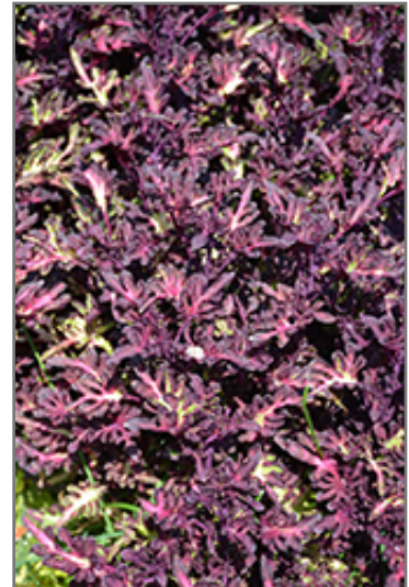
Merlin's Magic Coleus foliage