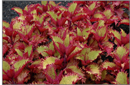
Henna Coleus foliage