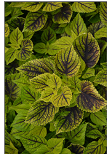
Gays Delight Coleus foliage