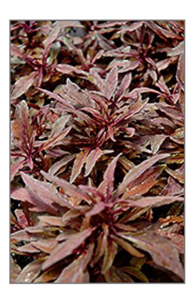
ColorBlaze Velvet Mocha Coleus foliage

ColorBlaze Velvet Mocha Coleus will grow to be about 3 feet tall at maturity, with a spread of 24 inches. When grown in masses or used as a bedding plant, individual plants should be spaced approximately 20 inches apart. Although it's not a true annual, this fast-growing plant can be expected to behave as an annual in our climate if left outdoors over the winter, usually needing replacement the following year. As such, gardeners should take into consideration that it will perform differently than it would in its native habitat.