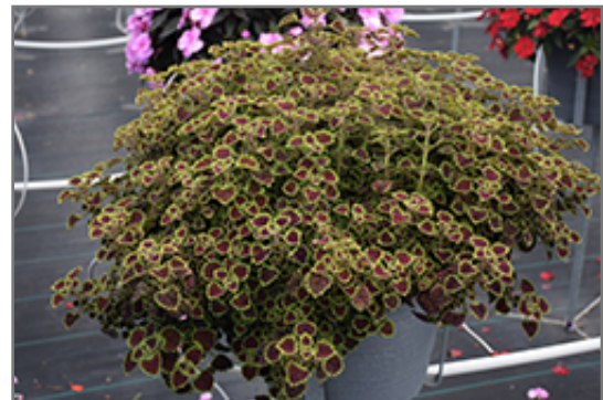
Burgundy Wedding Train Coleus