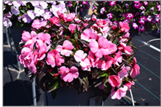
Sonic Light Pink New Guinea Impatiens in bloom

Sonic Light Pink New Guinea Impatiens will grow to be about 12 inches tall at maturity, with a spread of 12 inches. When grown in masses or used as a bedding plant, individual plants should be spaced approximately 10 inches apart. Its foliage tends to remain dense right to the ground, not requiring facer plants in front. This fast-growing annual will normally live for one full growing season, needing replacement the following year.