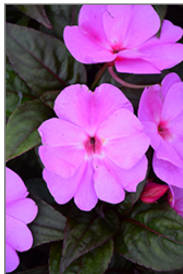
Divine Lavender New Guinea Impatiens flowers

Divine Lavender New Guinea Impatiens is recommended for the following landscape applications;