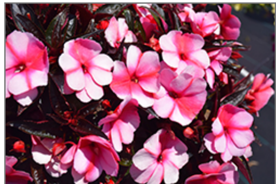
Super Sonic Sweet Cherry New Guinea Impatiens flowers