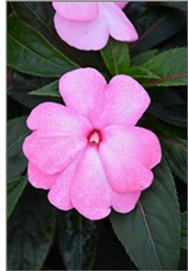
Super Sonic Pastel Pink New Guinea Impatiens flowers

Super Sonic Pastel Pink New Guinea Impatiens is recommended for the following landscape applications;