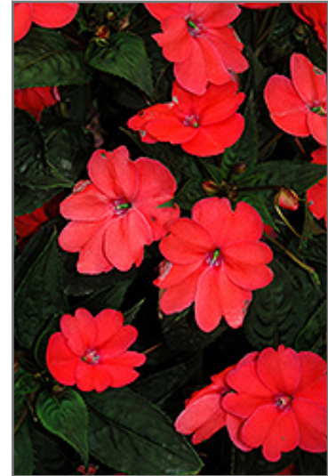
SunPatiens Compact Coral New Guinea Impatiens flowers

SunPatiens Compact Coral New Guinea Impatiens is recommended for the following landscape applications;