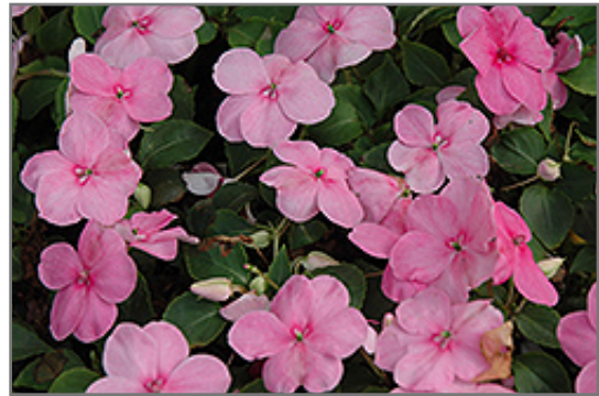
Super Elfin XP Pink Impatiens flowers