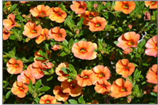
Can-Can Apricot Calibrachoa flowers

Can-Can Apricot Calibrachoa is recommended for the following landscape applications;