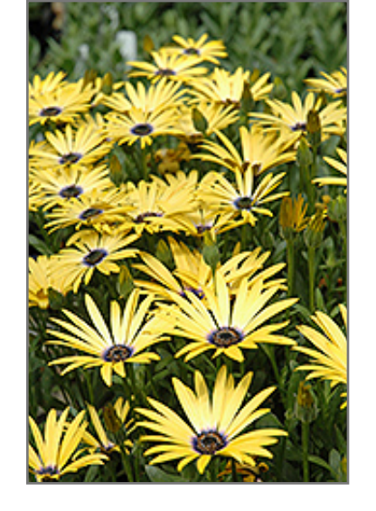
Lemon Symphony African Daisy flowers