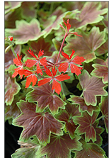
Vancouver Centennial Geranium flowers