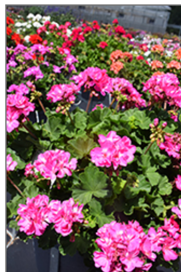
Fantasia Shocking Pink Geranium in bloom