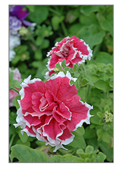
Pirouette Red Petunia flowers

Landscape Services & Design Center 1190 W. Moana Lane Reno, NV 89509 (775) 825-0602 ext. 134 NV Lic. #3379A, D & CA Lic. #317448