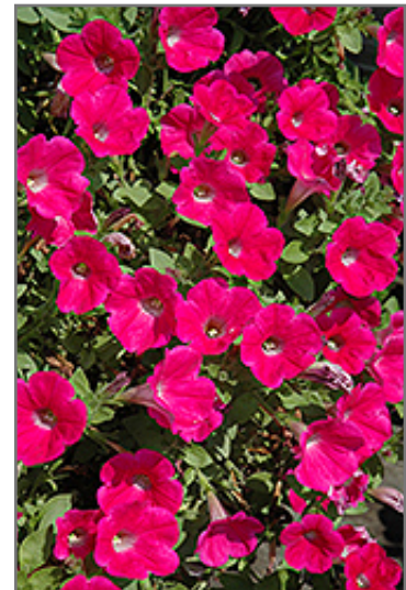
Piccola Hot Pink Petunia flowers