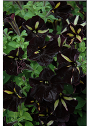
Phantom Petunia flowers