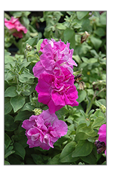
Double Madness Lavender Petunia flowers